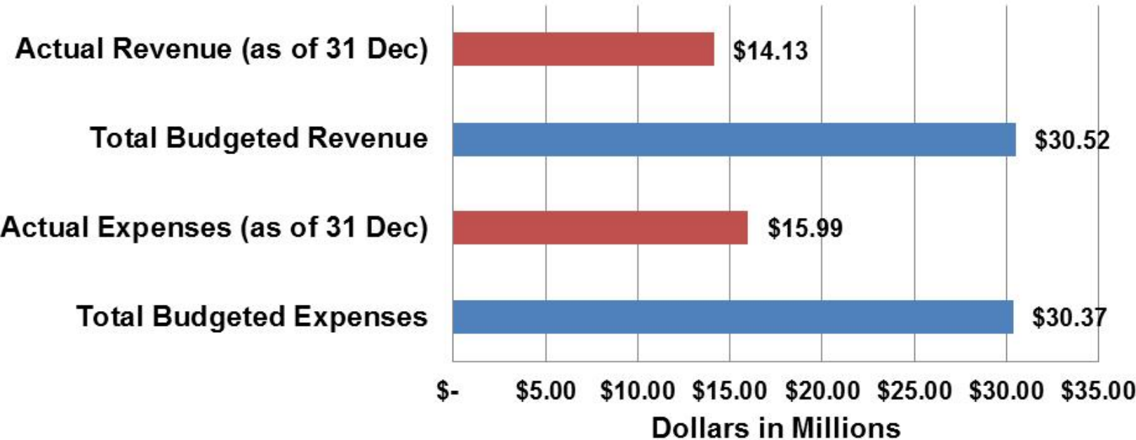
Actual vs. Planned From 1 Jul 2020 to 31 Dec 2020 (values in millions)