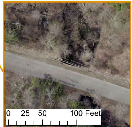
Heald Street Culvert 42.670185, -71.613507